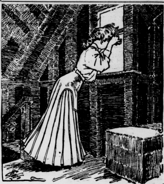
I GOT A SQUINT AT THE ATLANTIC THROUGH A PAIR OF OPERA GLASSES.

TRIP LOOKS FINE AT THE START BUT THE POOR OLD GIRL GETS THE USUAL LEMON