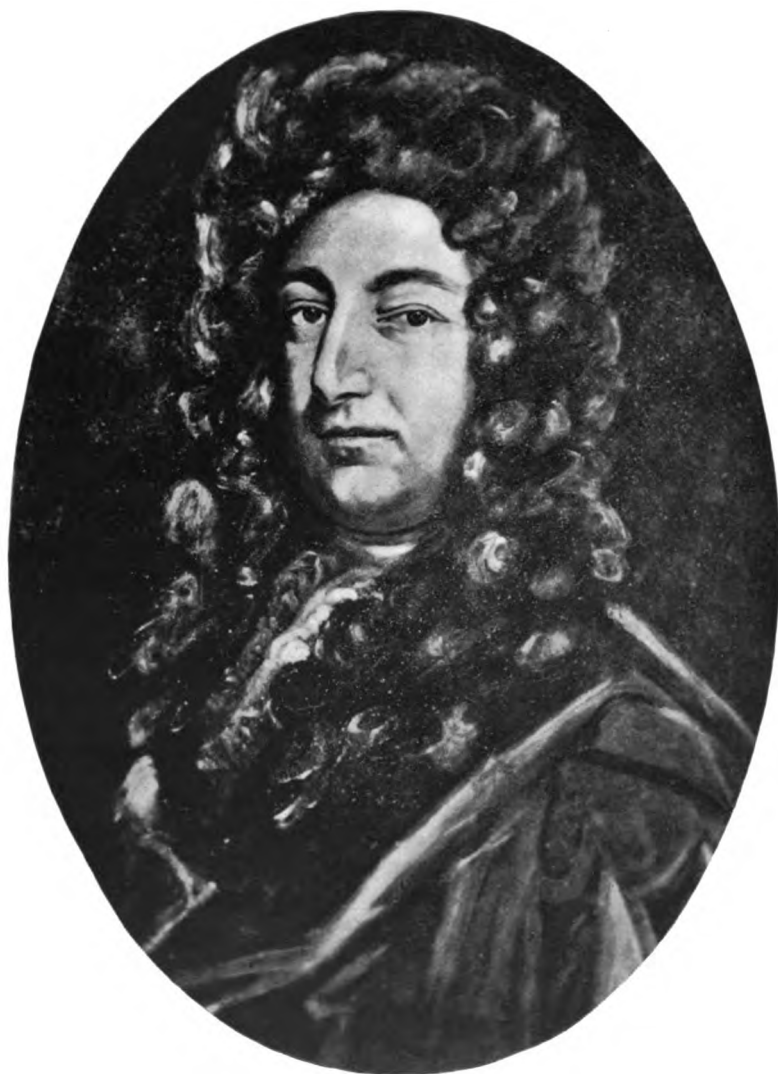
LORD HOWARD OF EFFINGHAM