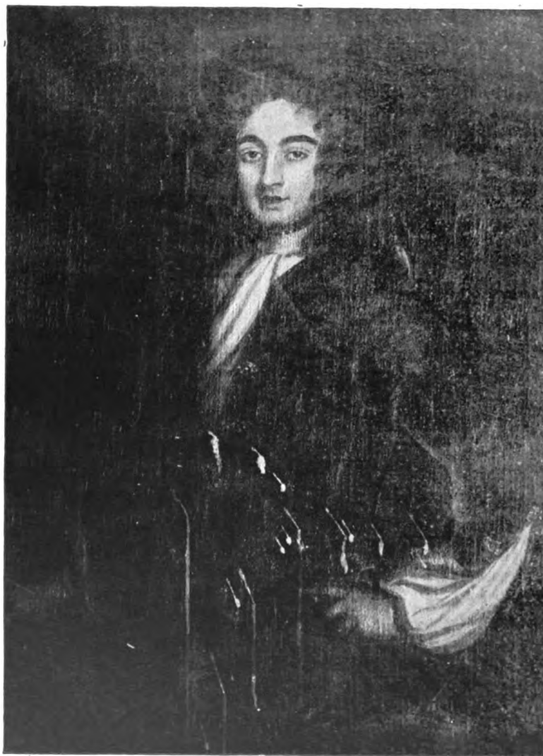
COL. WM. BYRD Founder of Richmond